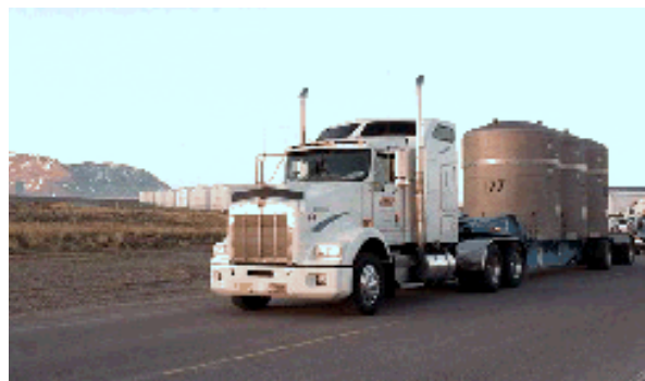
Figure 2: Transporter with TRUPACT-II Containers

The payloads are loaded into TRUPACT-II containers. Once the TRUPACT-IIs are loaded, shipping information is loaded into the TRANSCOM satellite tracking system for continuous tracking during transport. Final radiological surveys are performed on the TRUPACT-II containers and transporter, then the shipment is released. Figure 2 shows a transporter carrying three TRUPACT-II containers.