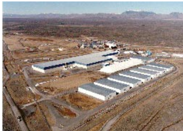
Figure 1: RCRA Compliant Storage Buildings

accomplished by identifying waste container populations with required waste codes from the appropriate database. Using container location coordinates, each drum is located and removed from the waste inventory. Approximately 22,000 drums have been identified from 33 waste streams to meet the 3,100-m 3 milestone. These drums were selected because of the probability that 15,000 drums from this population will successfully pass the rigorous characterization and certification requirements. Figure 1 shows RCRA compliant storage buildings containing CH-TRU waste.