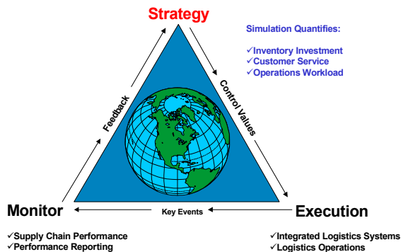
Figure 1: Cat Logistics Philosophy

Cat Logistics employs a closed loop philosophy to ensure inventory and service targets are met. On an ongoing basis, inventory managers execute and monitor the strategy determined through simulation (Figure 1).