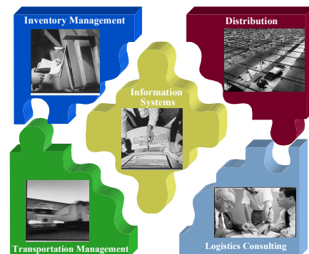
Figure 2: Cat Logistics Services

As an integrated logistics provider, Cat Logistics distinguishes itself from traditional providers by offering a comprehensive package of services. These services include distribution, logistics information services, transportation, inventory, and supply chain management, and related consulting services (Figure 2). Diverse experience in these areas enables Cat Logistics to develop value-added, integrated solutions for clients. These services handle the entire logistics supply chain - from concept and strategy to daily operations.