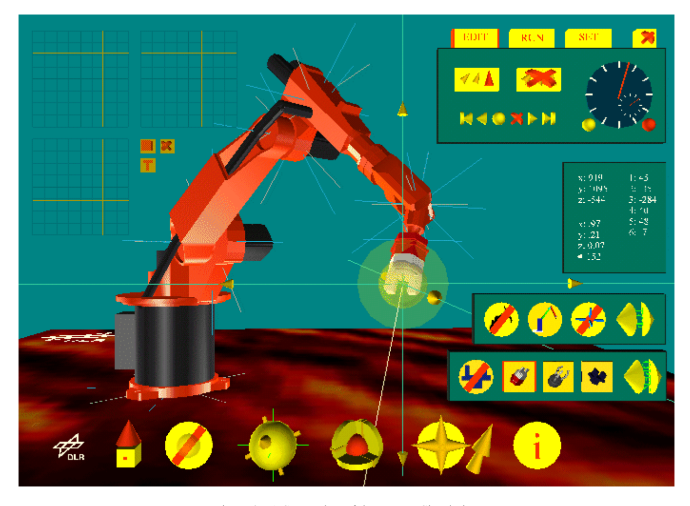
Figure 3: A Screenshot of the VRML Simulation