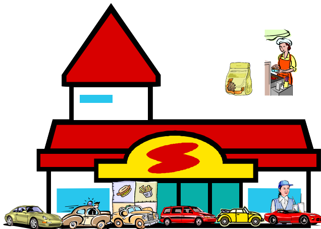
Figure 3: State of the System at Noon

The calendar of this system is made up of the entities that are scheduled to complete an activity with a specific time duration. These entities are Car 1, Car 4, the Order for Car 2, and Car 7. The calendar for these four entities is shown in Table 1.