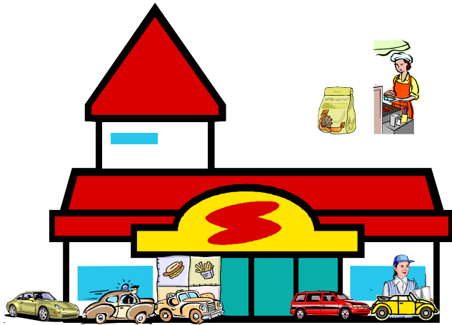
Figure 4: The State of the System at 12:00:40 PM

We also update our statistics at this time. As we described in at time 12:00:20 PM, we look at what has happened since the last time we updated the statistics in order to determine the new values for the statistics. So, what number will we use to calculate the new average number of cars waiting for the Order Window , 2 (the number in line at 12:00:20) or 1 (the number in line now)? The answer is 2 because from time 12:00:20 PM to 12:00:40 PM there were 2 cars waiting in line. The new values for the statistics are shown in Table 6.