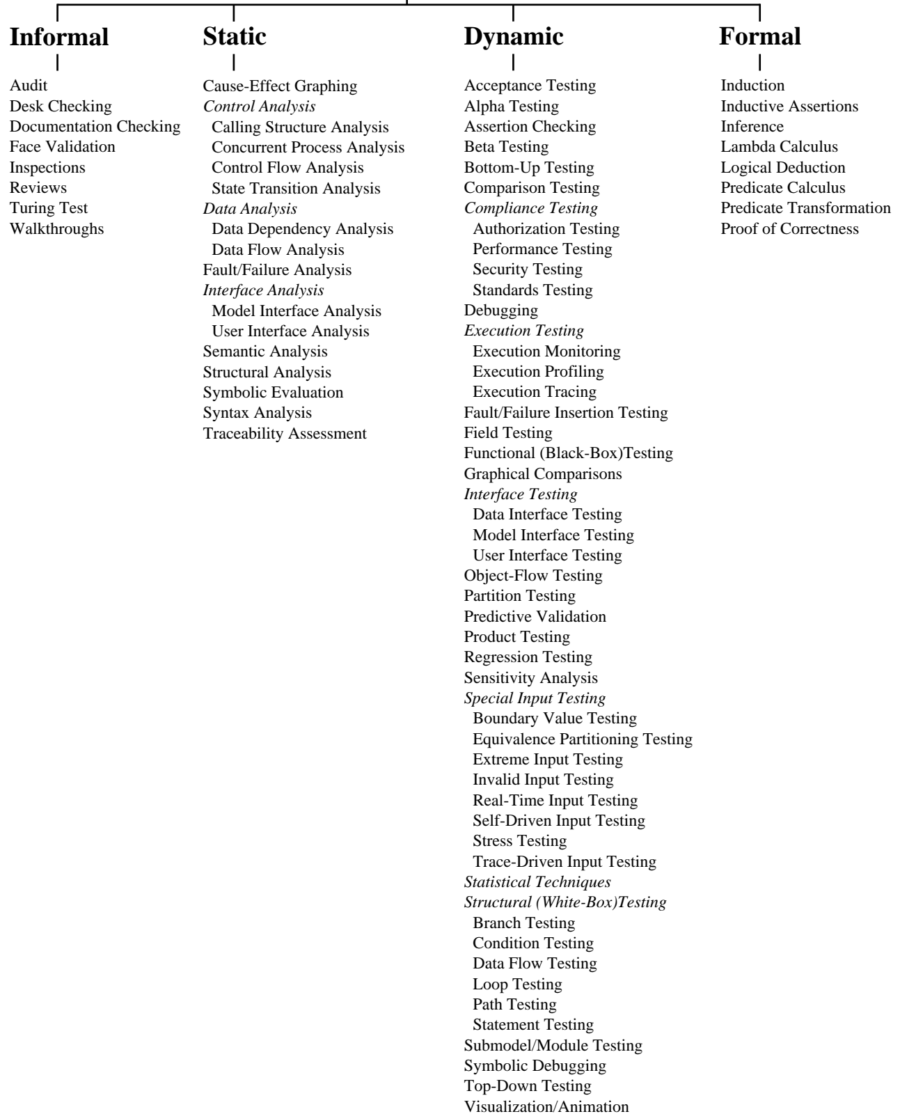
Figure 2: A Taxonomy of Verification and Validation Techniques for Conventional Simulation Models