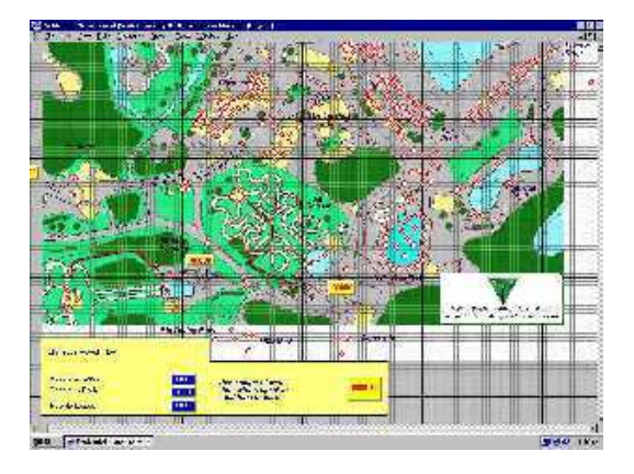
Figure 4: Water Country USA Simulation