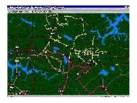
Figure 3: Virginian Pilot Route Model

selection. When this is completed, a discrete event simulation tool will be used to determine the effects of uncertainty on system performance. The short term objective is to identify a more efficient single-paper distribution system for the existing delivery stations. It is estimated that annual savings of up to $200,000 are possible. The route model for the Virginian Pilot is shown in Figure 3. The longer term objective of the project is to provide the newspaper with a tool which can be used to reorganize the distribution system as new distribution points are added, demand increases, or supply constraints change over time.