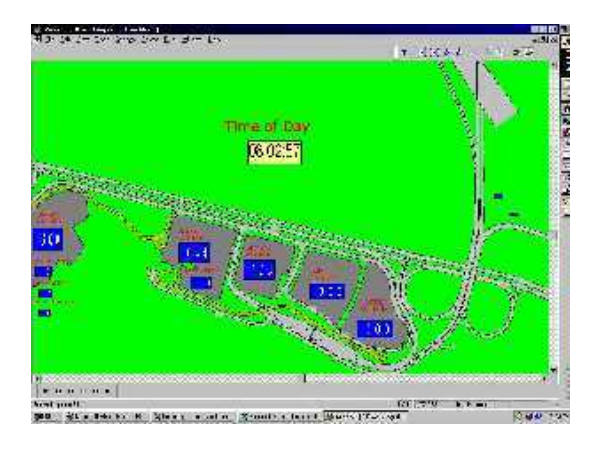
Figure 1: Busch Gardens Simulation

Written and spoken language often are not adequate tools to describe highly complex or very detailed situations.